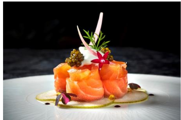
Homemade Gravlax with Oscietra Caviar and Apple Carpaccio