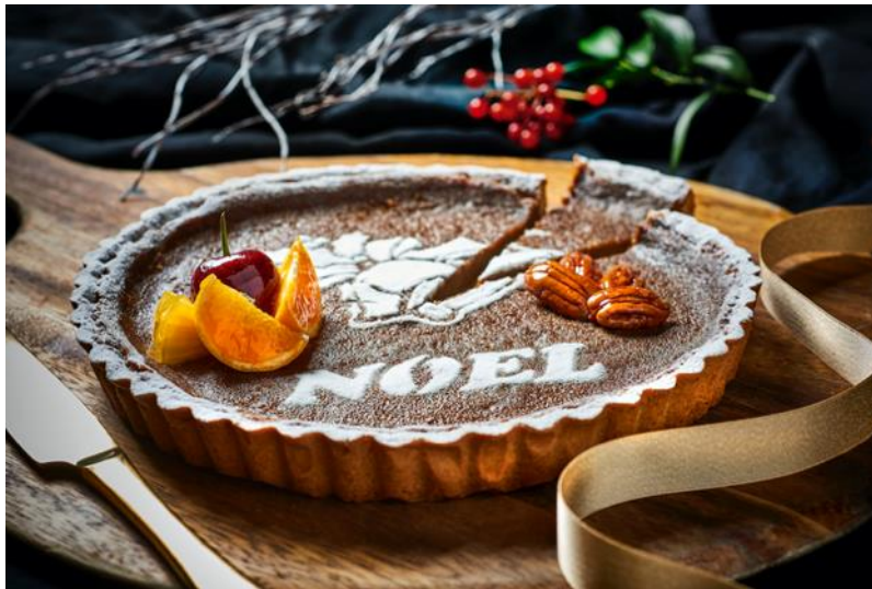
Festive Pumpkin Pie

From a decadent Christmas Brunch at the Grand Ballroom Foyer to a New Year's Eve countdown party in the Grand Ballroom, the island resort gives reason to be merry this year-end.