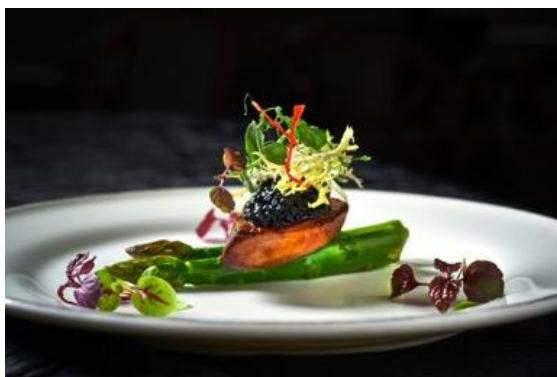
Pan-Fried Foie Gras with Japanese Sake, Asparagus and Black Caviar