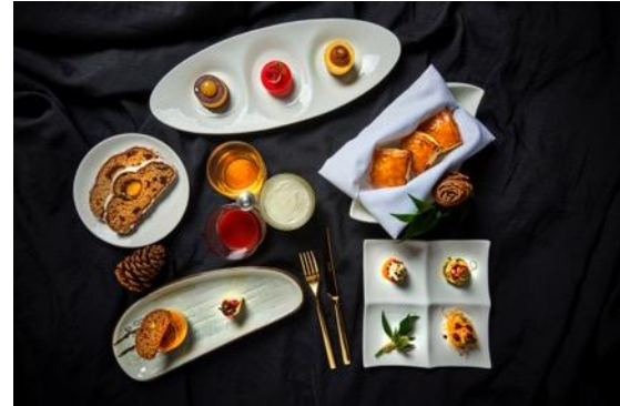
Festive Afternoon Tea

Festive Hampers complete with homemade creations such as Panettone , Stollen and Gingerbread Man Cookie , complete with Naveganthé South Sea Tea , Billecart-Salmon Brut Réserve NV Champagne , and various other decadent goodies to spread the Christmas spirit. Guests can also enjoy Capella's classic turkey and traditional desserts from home with its Classic Turkey Medley Package .